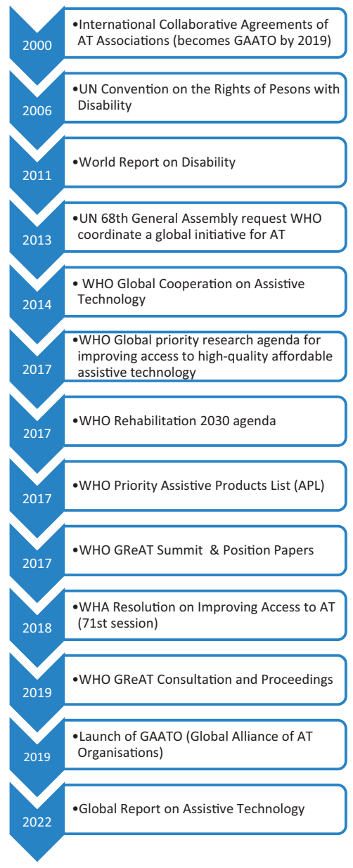
Figure 1. Assistive technology milestones since 2000.

International collaborative agreements amongst AT stakeholders are emerging in regions such as Asia and Latin America, with precursor "community or practice" networks forming in for example Africa and India [12]. The Global Alliance of Assistive Technology Organisations (GAATO)<sup>2</sup> is a non-profit association of legally established membership organisations from different countries or world regions. GAATO builds on twenty years of international alliances to fill a perceived gap and need for a unified global platform to represent the AT sector and coordinate with governments and international bodies such as the WHO and UN.